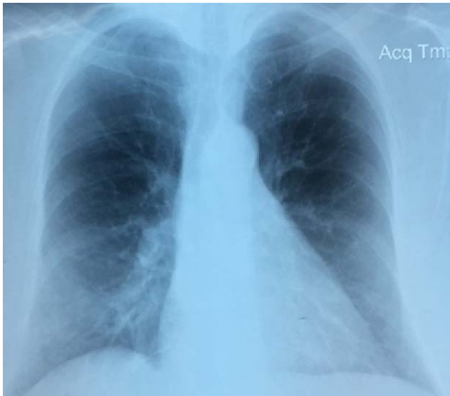
FIGURE 1. Posteroanterior chest X-ray: reticular, net-like shadowing of the lung, more predominant towards the lung bases; bilateral, middle-zone emphysema.

To exclude other etiologies regarding the patient’s symptoms, several tests were made, including nasal and pharyngeal swab (both came back negative), thyroid hormone test (within normal range), as well as thyroid