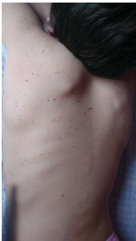
FIGURE 2. Multiple lentiginos on the posterior chest wall and shoulders

The patient underwent a Morrow myectomy for relief of the LVOT obstruction, and right myectomy for relief of the RVOT obstruction. Immediately after surgery, she presented a transitory complete AV block, but with subsequent spontaneous recovery of the sinus rhythm.